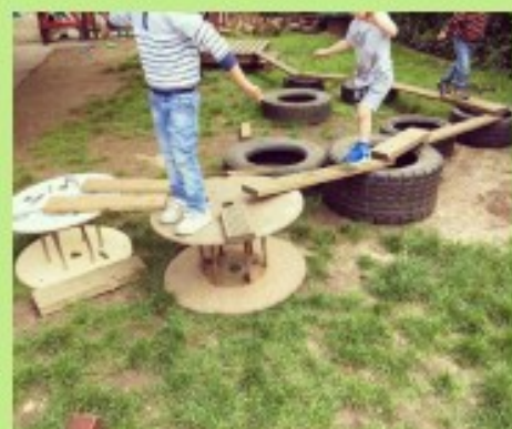
Cabel reels Planks of wood crates