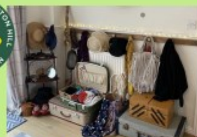
hats & props

Help us transform our Reception classrooms!