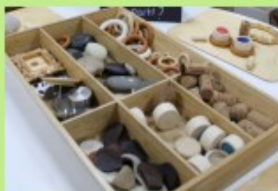
Loose parts; keys, corks, bottle tops, natural resources (pinecones etc)