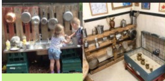
Metal kitchen pots & pans