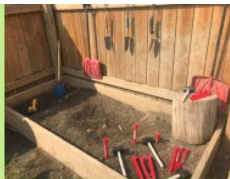
Gardening tools; Child friendly, rakes, spade trowels, soil, stones