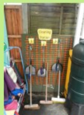
Brooms, dust pan and brush