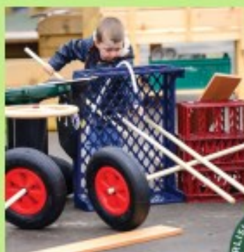
wheels old steering wheels