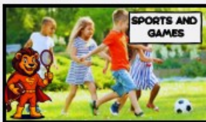
SPORTS AND GAMES

THIS FEBRUARY HALF-TERM, JOIN LION PACK HOLIDAY CAMPS FOR SUPERHEROES WEEK!